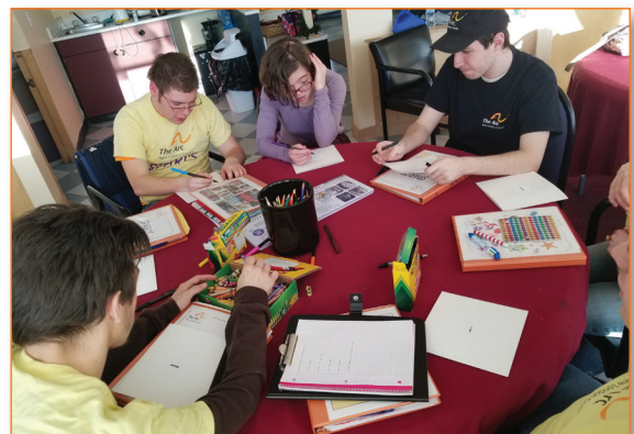
The Arc NLC's SPARCS (Student Peer Advocates Raising Community Support) program started off 2018 by making "resolution books" to talk about using the program's learning tools for self improvement.

program. The group of 30 men and women performed over 550 hours of service this past year at over 23 events including fundraising road races, health fairs, fall cleanups, and senior center functions. They were praised for their civic responsibility and for demonstrating that people with IDD are an integral part of the community. 🍌