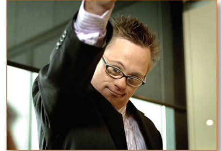
"The Interviewer" is a contender for inclusion in this year's Film Festival offerings.

Please join The Arc New London County at the Mashantucket Pequot Museum and Research Center for an entertaining and inspiring evening of award-winning short films about people with IDD. Enjoy an evening of culture and fine food provided by MPMRC Catering along with a quality silent and basket auction.