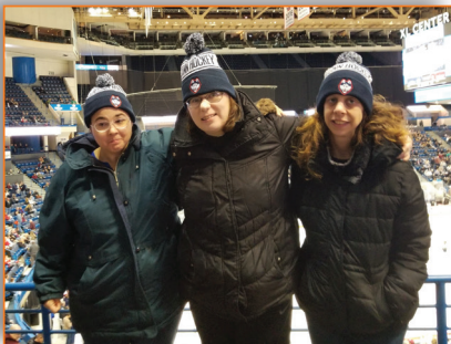
The women are also UConn Hockey fans

“We had to go across the street and get water from the pond to flush the toilets.”