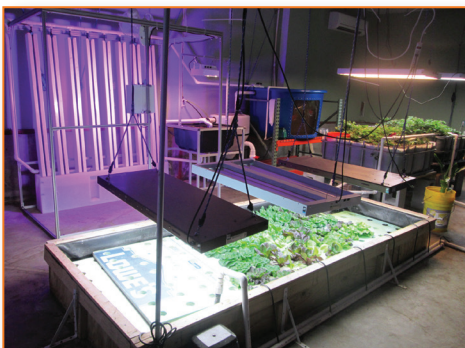
The new towers, installed in January, are ready for planting and can hold 164 heads of lettuce at a time.

The Arc NLC's Farm Stand and Aquaponics program anticipates its best season ever. The 2017 pilot Community Supported Agriculture (CSA) shares sold out within hours of being advertised, and the Farm Stand plans on offering more pre-paid shares this year. The regular supply of over 14 varieties of fresh organic produce also will be available to the public. (Remember: the Farm Stand sells The Arc's homemade baked goods too!) The Farm Stand plans to extend its growing season, thanks