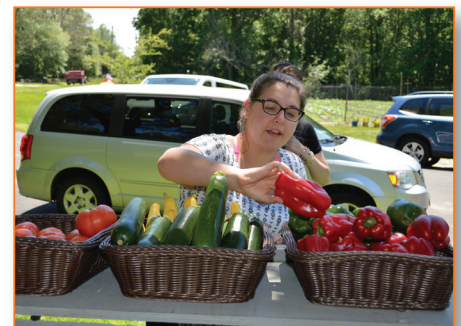
Another happy customer!

with the Town of Ledyard to create a larger CSA on Town property continues! 🌱